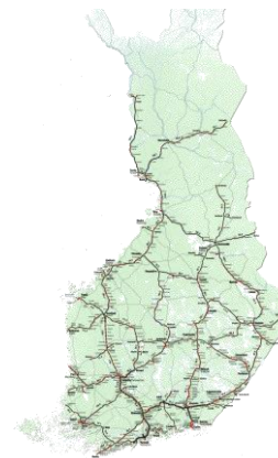
Main Line signalling

Rail signalling (ESTW) and Kouvola Traffic Control Centre